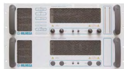
Model AS1860-100 1.8-6.0GHz 100W P1dB