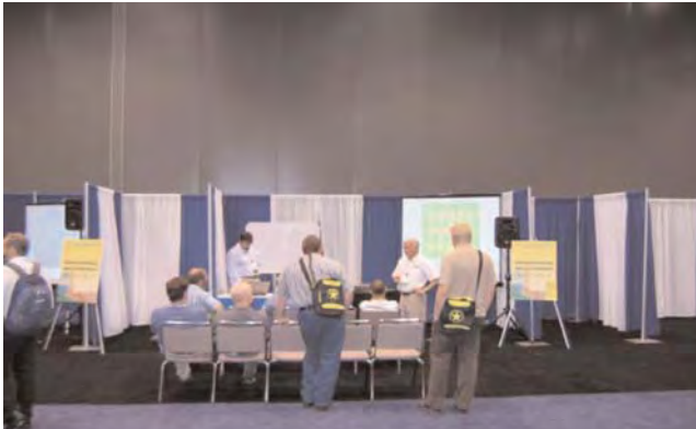
Dr. Vince Rodriguez and Tom Mullineaux take questions at the end of the demonstration

The results showed reasonable correlation with the modelled results, with a key conclusion being the fact that the greatest field strength occurs at the centre of the calibration plane (boresight), with the field strength dropping with distance from the boresight. This often overlooked fact has implications for field uniformity in that if the calibration matrix just falls inside the 3dB beamwidth of the antenna, the 18v/m requirement at a matrix corner point demands 25v/m at the boresight (centre of the calibration plane).