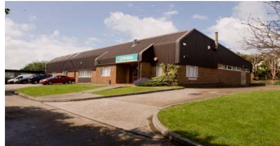
Second facility at Park Road, Ryde

In 2006 the Company acquired a second factory on the Isle of Wight and now operates from the two locations with an increased output capacity of 60%.