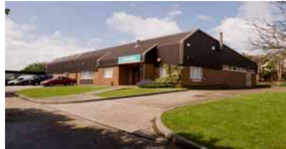
MILMEGA facility at Park Road, Ryde

In 2010 the Company relocated to its' current factory on the Isle of Wight.