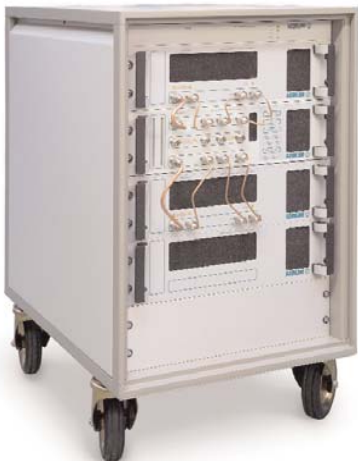
Photograph shows amplifier mounted in a wheeled rack casing, Option 22